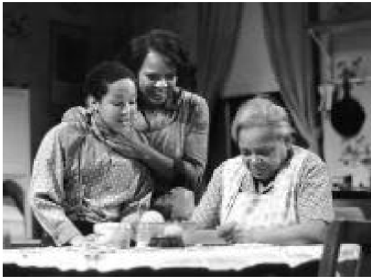
Scene from Raisin in the Sun at Intiman Theatre, Photo courtesy of Intiman Theatre.